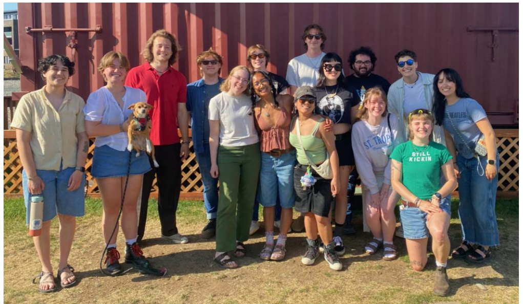
UEPP student club officers at graduation celebration