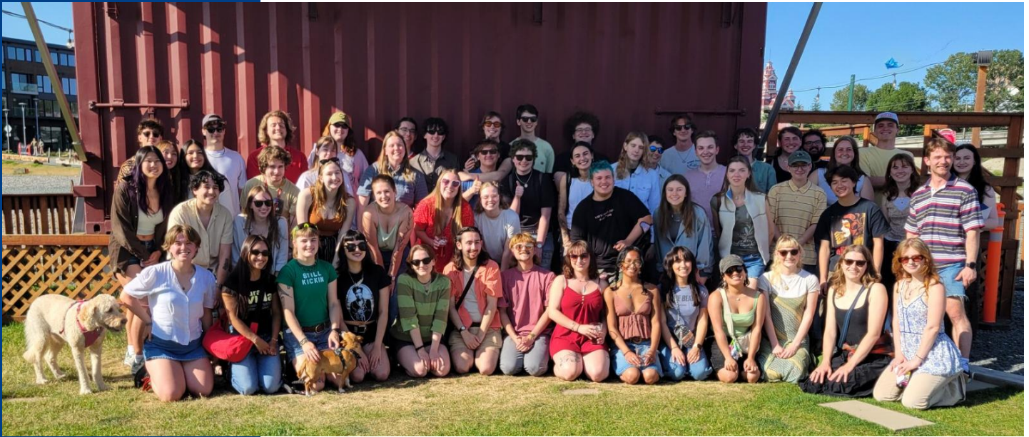
UEPP students at graduation celebration at the Portal Container Village at the Bellingham waterfront