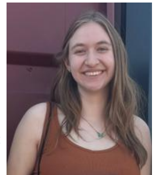
Martha Macchiarella College of the Environment Community Service Award